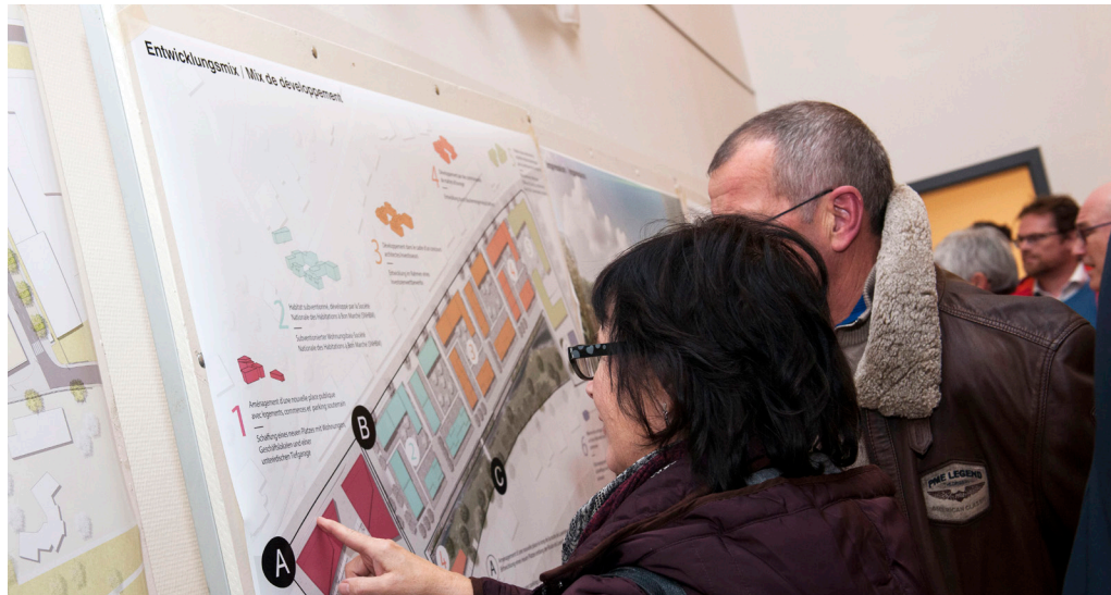
information event december 2016