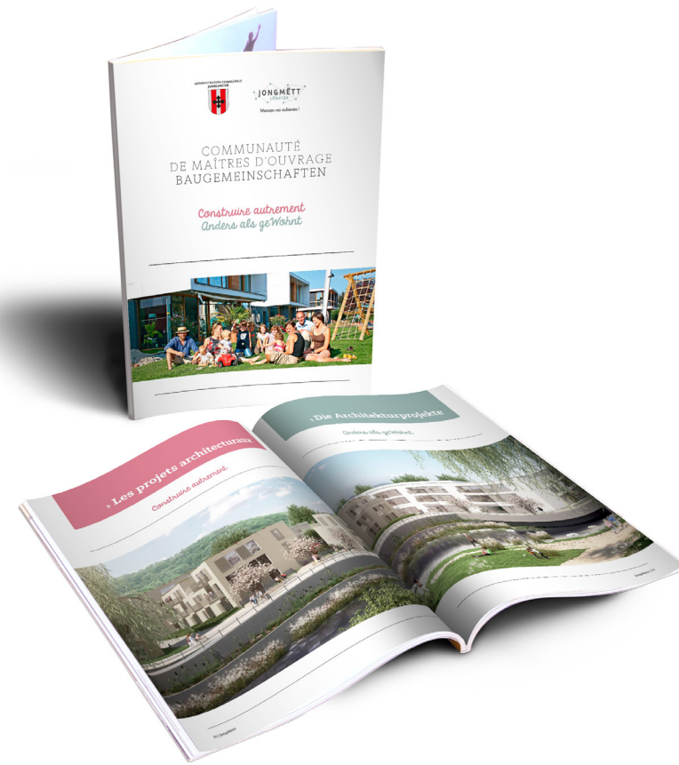
information brochures in the context of the information campaign