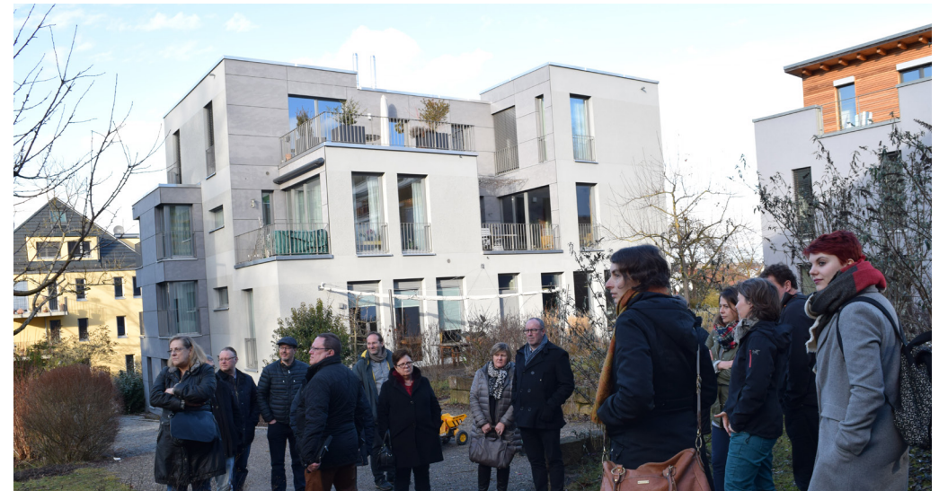
joint excursion to Tübingen february 2017