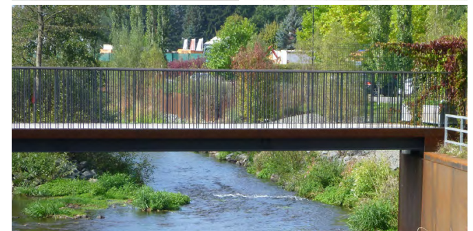
reference: bridge over the Enz