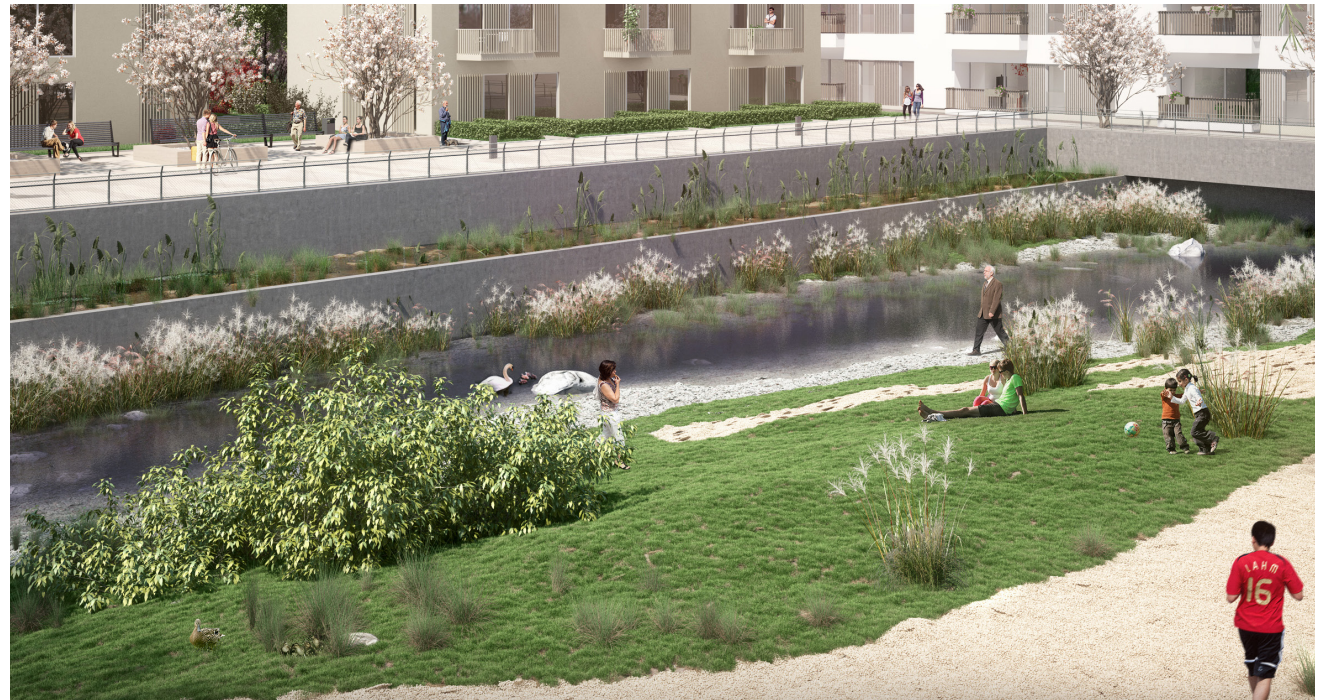
new city park along the renatural Ernzt Noir