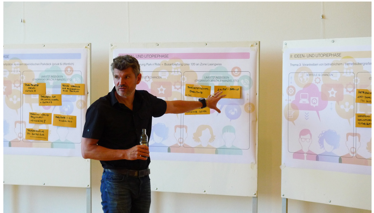
Working session with the project management group