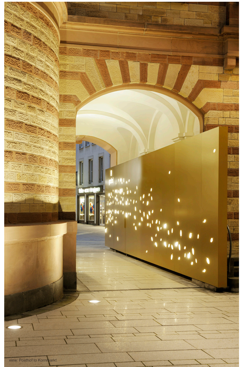
view: Posthof to Kornmarkt

The newly created display windows yield to the overall façade and are within the context of the existing historical building. The formerly unwelcoming Kornmarkt façade becomes part of the square, which undergoes a visual extension as a result. In close alignment with the lower and upper historical preservation, the display windows on the ground floor were consequently designed to be largely sashless. A vertical partition was created solely for the window openings spanning the portal width under incorporation of the window lines of the upper floors. This project draws on the several fine examples of Trier's existing historical buildings having undergone successful and contemporary treatment and ties in with the philosophy of other properties known outside the region.