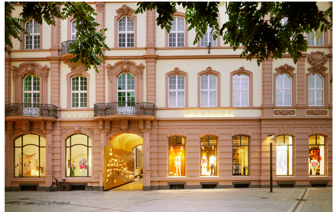
view: Kornmarkt to Posthof